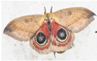
( Pseudoautomeris lutea )