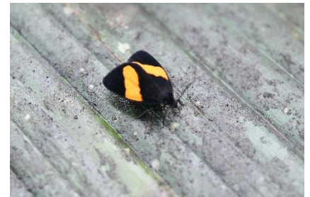
( Crocomela colorata )