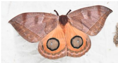
( Automeris godartii )