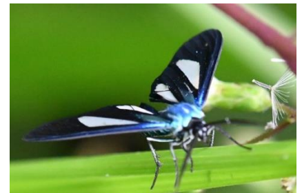
( Cacostatia flaviventralis ) ?