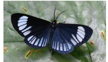
( Hypocrita aletta )