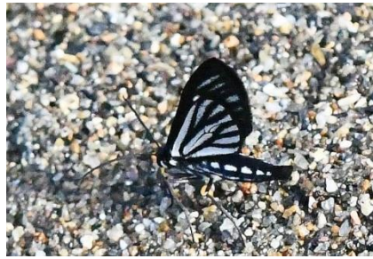
( Drymoea hesperoides )