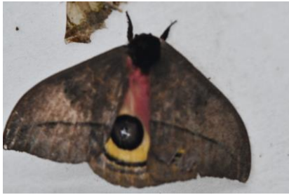
( Automeris argentifera )