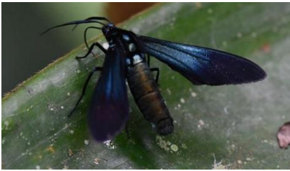
Banana Stowaway (Antichloris eriphia)