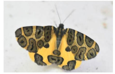
Blotched Leopard (Pantherodes colubrarie)