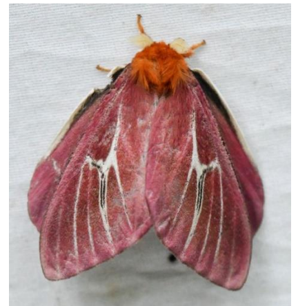
( Cerodirphia candida )