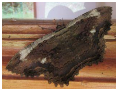
(Feigeia claricostata) Noctoid