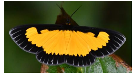
Saffron Playboy (Xanthiris flaveolata)