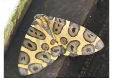
Blotched Leopard (Pantherodes colubrarie)