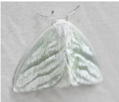
Carpet moth ( Dyspteris tenuivitta )