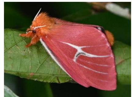
( Cerodirphia candida )