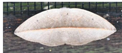
( Lonomia sp.)