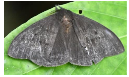
( Periphoba arcei )