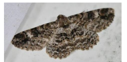
(Epimecis nr naxis)