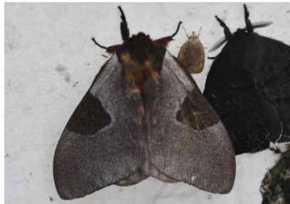
( Dirphia triangulum )