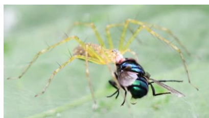
Spider with fly