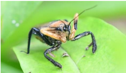
Unidentified predatory insect