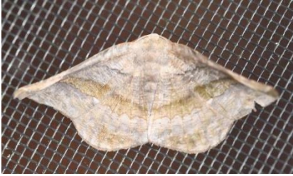
( Patalene sp.)