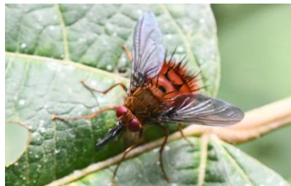
Bristle Fly ( Hystricia abrupta )