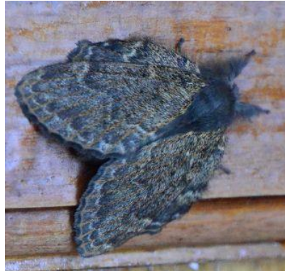
( Hypopacha ?)