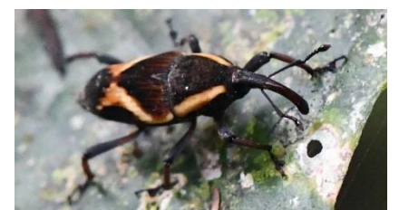
Weevil ( Cactophagus ? )