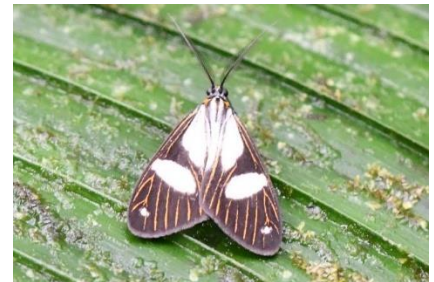
Deaf Zebra (Euchontha frigida)