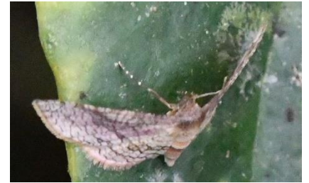
Picture-winged leaf moth