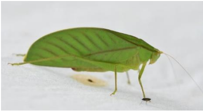
Katydid ( Microcentrum ?)