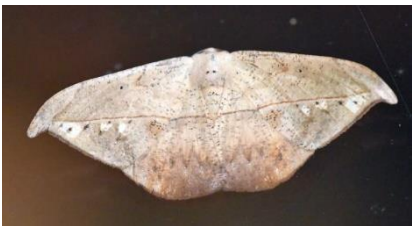
( Oxydia platyptera )