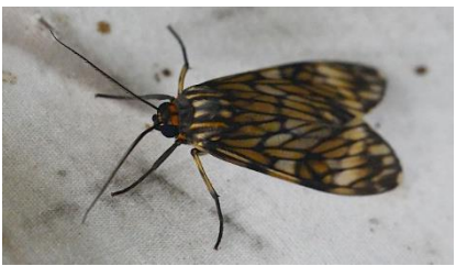
Marbled Tiger (Theages decoram)