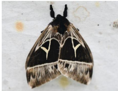
( Dirphia subhorca )