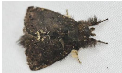
( Euglyphis ?)