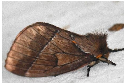
( Pseudodirphia agis )