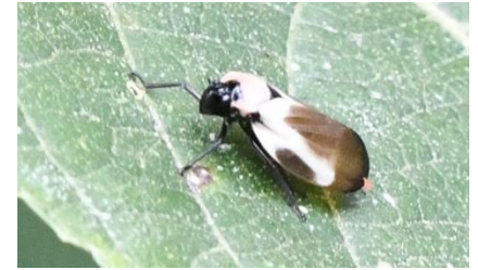
Spittlebug (Sphenorhina quadrifera)

The following are a few other insects I happened to see along the way.