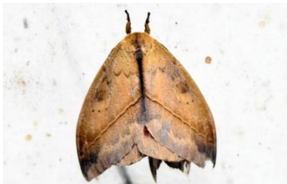
( Automeris sp.)