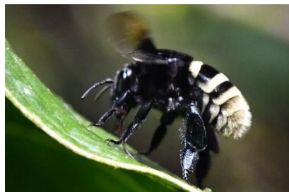
Bumblebee ( Bombus pyrrhopygus )