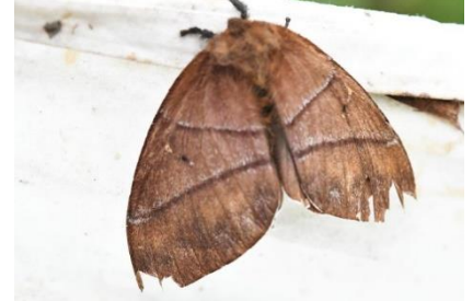
( Periphoba arcei )