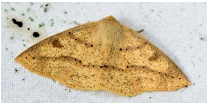
( Periclina sp.)