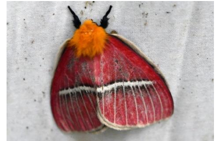
Hemileucine Giant Silkmoth ( Pseudodirphia menander reducta )