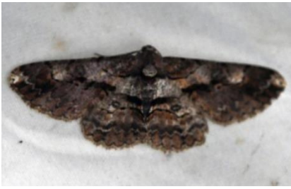
( Epimecis nr naxis )